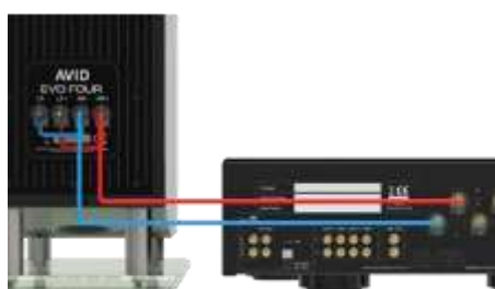
Standard wiring configuration

Bi-wiring can be beneficial in reducing the interaction of the L.F. and H.F. sections of the crossover—moving the common earthing point to the amplifier, rather than the crossover itself, separates the vastly different current characteristics experienced by each drive unit, resulting in a cleaner, more accurate signal for each drive unit. The scale of the improvement is dependent on the crossover's topology—the EVO crossovers are designed to minimise the effect however bi-wiring can still prove beneficial, and is well worth taking time to investigate.